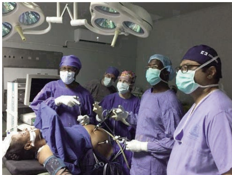
Bassett and Zambian surgeons collaborate on a surgical case at the University Teaching Hospital in Lusaka, Zambia.

Four surgeons from Bassett Medical Center recently returned from a trip to southern Africa where they trained a group of surgeons there how to perform abdominal laparoscopic surgery, also known as minimally invasive surgery. The surgeons they trained will extend the reach of the Bassett project by training fellow African doctors in this more advanced surgical technique, which is expected to result in expanded access to this type of surgery for the poor, shorter hospital stays and better outcomes.