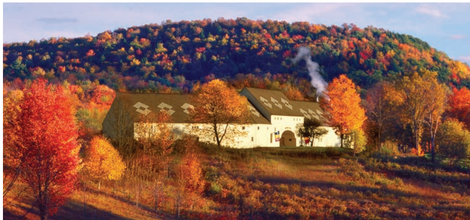
Brewery Ommegang, the unique Belgian-style brewery, will be the host location for the Reunion's Opening Reception on Friday evening, October 11th.

Friday evening we invite local alumni and our guests from out of town to join us for an opening reception at Brewery Ommegang at 6:00 p.m. Located only four miles from Bassett, Ommegang offers an experience that is akin to a trip to Belgium. We will enjoy camaraderie, beer tastings, and light repast at this unique farmstead-style brewery. Some of you might want to join us at Ommegang after attending the Appreciation Celebration honoring Drs.